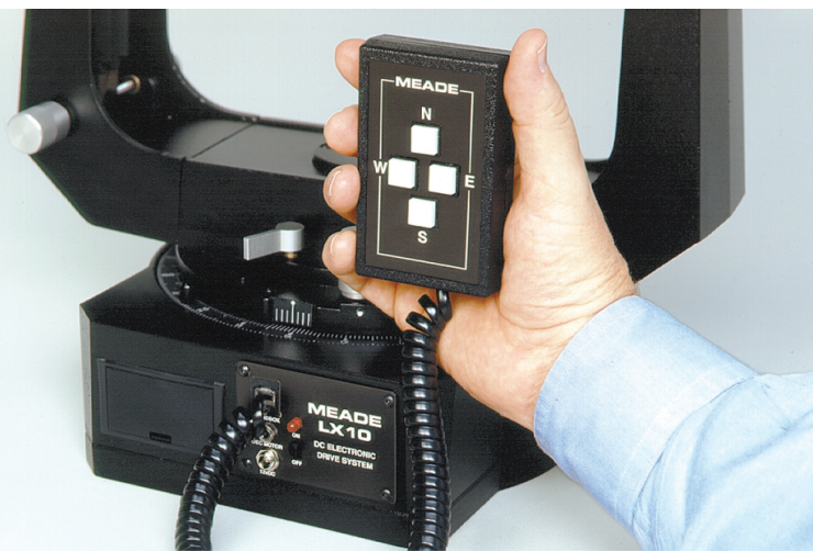
Control panel, hand controller, and battery compartment of the Meade 8" LX10.

Optional Accessories: The full range of Meade Schmidt-Cassegrain accessories, including optional eyepieces, Barlow lenses, camera adapters, filters, off-axis guider, and much more, is available for the LX10. See pp. 54 - 55 for details.