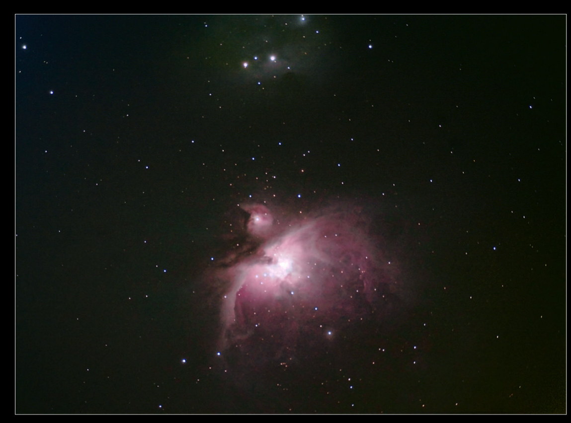
M 42 The Orion Nebula