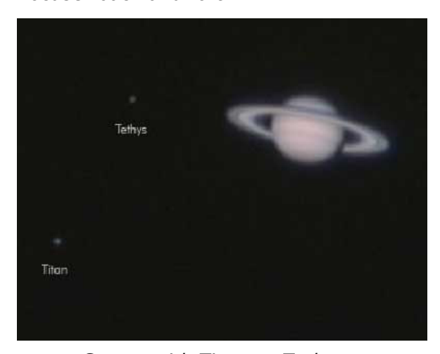
Saturn with Titan en Tethys.

The two speed focuser did a fine job here; its usability increases when magnifications gets higher. We didn't use the fine focuser at low magnifications, because there was no real improvement over the conventional Crayford focuser. Using the fine focuser at high powers is was a delight and objects appeared sharp in just a second; no need for moving the focuser back and forth.